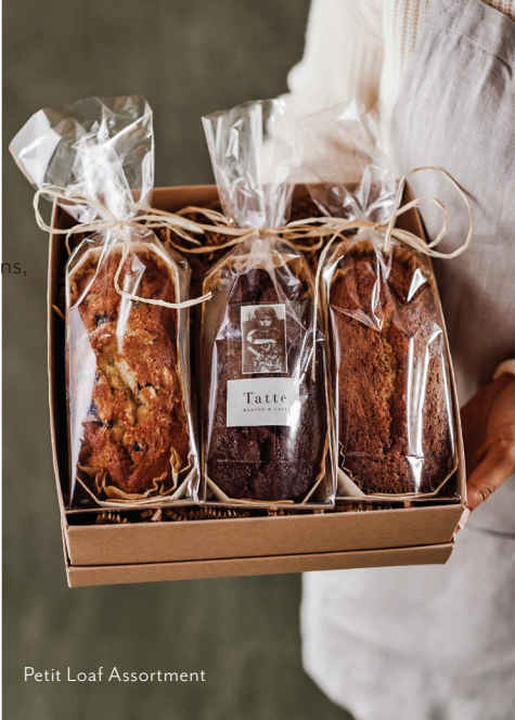
Petit Loaf Assortment