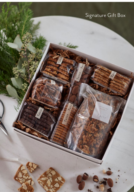
Signature Gift Box